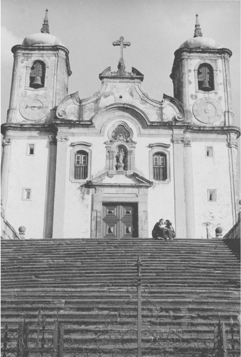
Santa Efigênia, where slaves worshipped. Elizabeth Bishop's favorite church in Ouro Preto, Brazil.